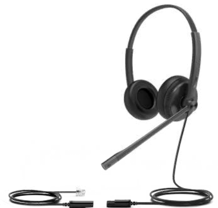
YHS34/YHS34 Lite Dual