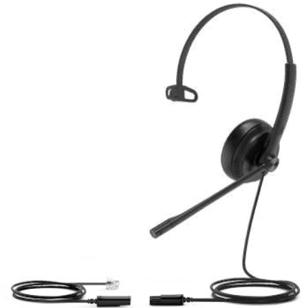
YHS34/YHS34 Lite Mono

Built for comfort with soft ear cushions and ultra-lightweight materials, the YHS34/YHS34 Lite is 10%~30% lighter than other headsets in the same range. Its ergonomic design makes this headset comfortable enough for long conference calls and all day use.